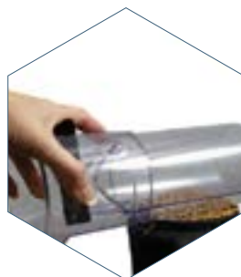
3. Level grain